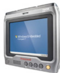
Vehicle Mount Computers